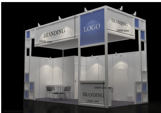
Design 3: 105/m 2

* The package includes 2 KW power supply per 18 m 2 .