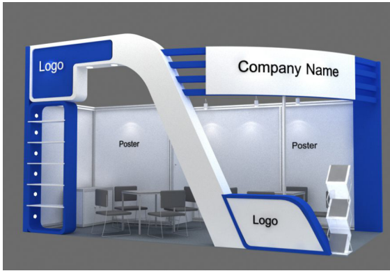
Design 4: 170/m 2

*The package includes 2 KW power supply per 18 m 2 . *Note: The visual design is for 18 m 2 (two side open booth). The design may vary if the stand size or number of sides open differ.