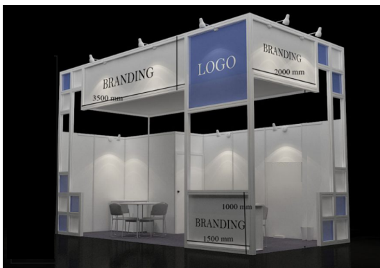
Design 3: 7500/m 2

* The package includes 2 KW power supply per 18 m 2 .